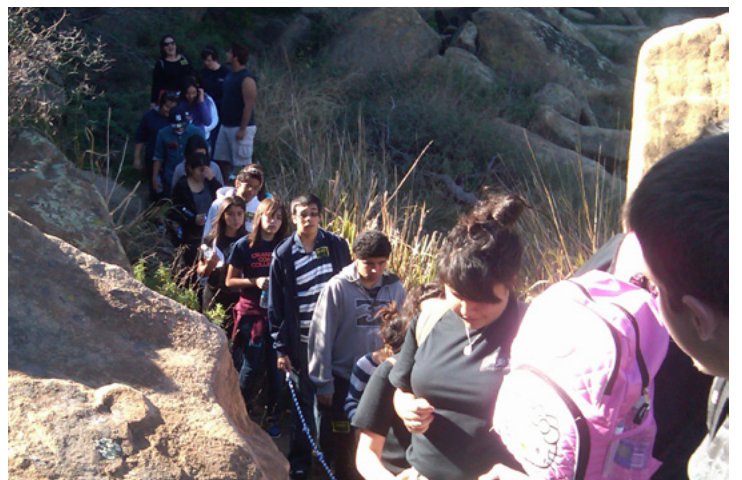
Encountering difficult terrain, boys would extend the rope to keep everyone safe.