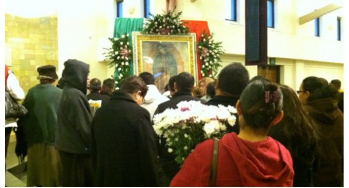
After mass many gathered for personal prayer before the image of Our Lady.