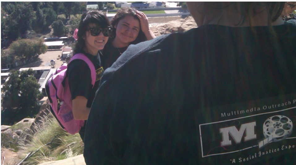
MOP leaders in T-shirts