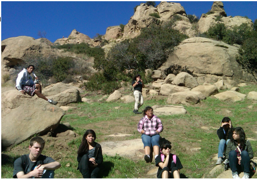
Sermon on the Mount (listening to a scripture reading)

Bible (Mat. 13:3-8). This gave the youth the feeling of how it may have been long ago when Jesus spoke to His people, preaching to them outside on the open grass and not necessarily in a church environment. We then gathered our things and the youth lead the way to the top of the mountain.