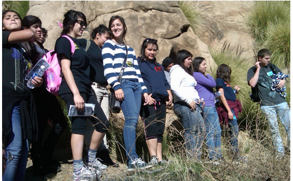
A brief pause to allow others to catch up

On Thanksgiving weekend the Multi-media Outreach Program (M.O.P.) youth leaders took Confirmation youth on a nature walk to Stoney Point. We started at Savio around 9:00 a.m. with our opening prayer followed by some games to introduce the youth to each other and to introduce the